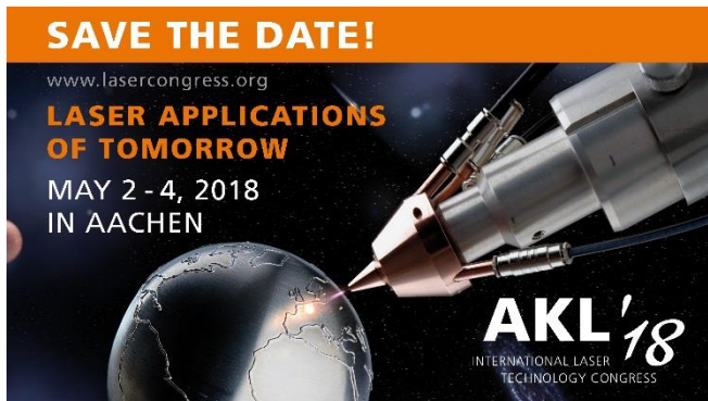
Picture 2: AKL'18– the extensive insight into the world of laser technology.

The Fraunhofer-Gesellschaft is the leading organization for applied research in Europe. Its research activities are conducted by 69 institutes and research units at locations throughout Germany. The Fraunhofer-Gesellschaft employs a staff of 24,500, who work with an annual research budget totaling 2.1 billion euros. Of this sum, 1.9 billion euros is generated through contract research. More than 70 percent of the Fraunhofer-Gesellschaft's contract research revenue is derived from contracts with industry and from publicly financed research projects. International collaborations with excellent research partners and innovative companies around the world ensure direct access to regions of the greatest importance to present and future scientific progress and economic development.