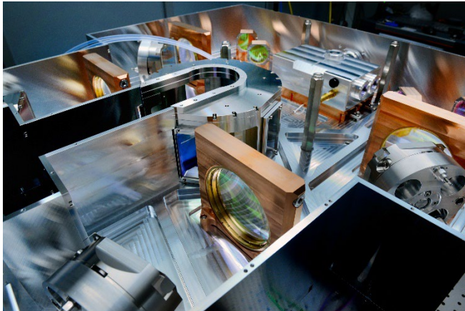
Figure 1: Gallium oxide crystals are produced in Japan with a 20 kW diode laser using the high-power optical system of the Fraunhofer ILT.

FRAUNHOFER INSTITUTE FOR LASER TECHNOLOGY ILT