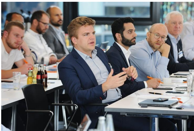
Image 4: Insider event of the hydrogen community: 70 participants met at the 4th Laser Colloquium in the fall of 2023 to learn about new approaches in laser-based hydrogen production.