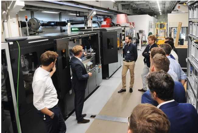
Image 3: Innovative neighbors: The program of the Laser Colloquium Hydrogen 2023 also included a visit to a facility at the neighboring Fraunhofer Institute for Production Technology IPT, which, among other things, demonstrated continuous roll-to-roll production of bipolar plates for fuel cells as part of the CoBiP project, which also includes Fraunhofer ILT.