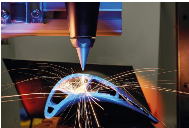
Image 3: The "Laser-based Manufacturing" technology platform shows SMEs, for example, how the use of laser drilling can optimize their production processes.

The Fraunhofer-Gesellschaft , headquartered in Germany, is the world's leading applied research organization. With its focus on developing key technologies that are vital for the future and enabling the commercial exploitation of this work by business and industry, Fraunhofer plays a central role in the innovation process. As a pioneer and catalyst for groundbreaking developments and scientific excellence, Fraunhofer helps shape society now and in the future. Founded in 1949, the Fraunhofer-Gesellschaft currently operates 74 institutes and research institutions throughout Germany. The majority of the organization's 28,000 employees are qualified scientists and engineers, who work with an annual research budget of 2.8 billion euros. Of this sum, 2.3 billion euros is generated through contract research.