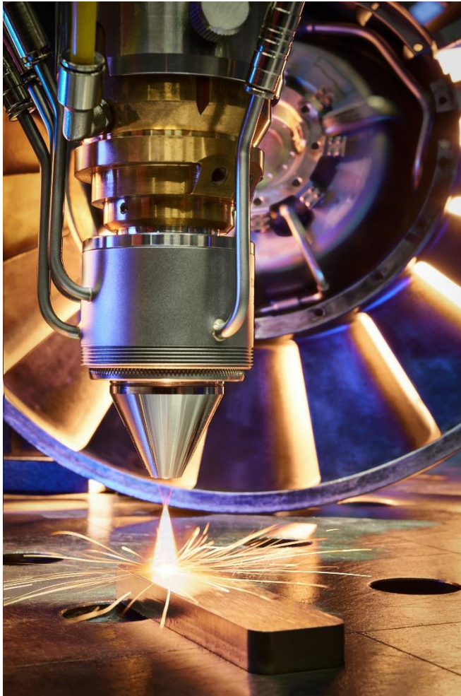
Image 1: With the "Laser-based Manufacturing" technology platform, experts from Fraunhofer ILT offer SMEs central access to numerous European specialist colleagues with years of experience. In the picture: Laser Material Deposition (LMD).

FRAUNHOFER INSTITUTE FOR LASER TECHNOLOGY ILT